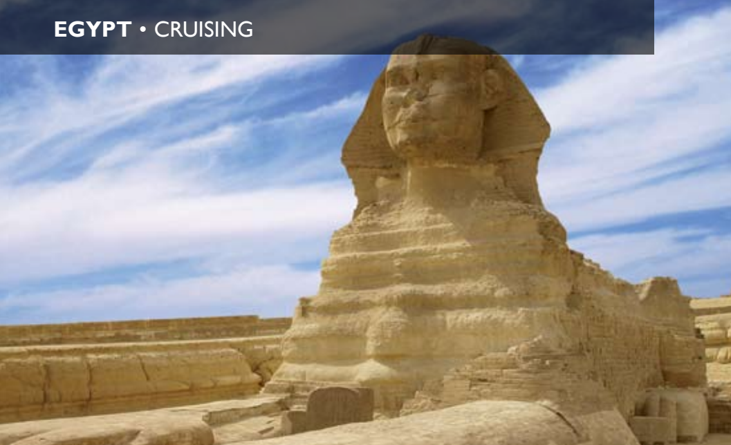
The Great Sphinx, Cairo