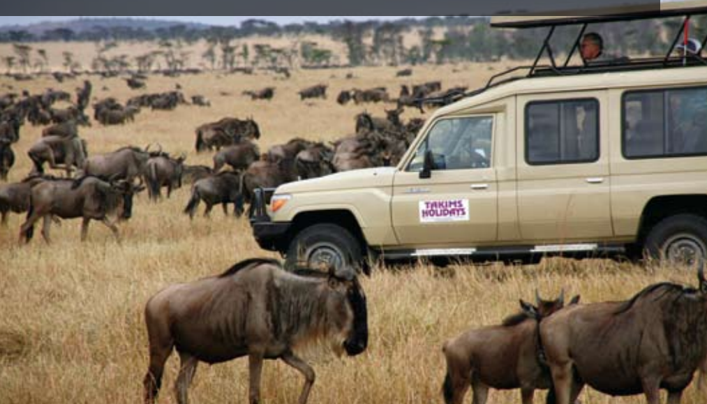
The famous Wildebeest migration