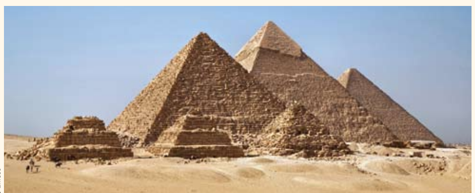
The famous Pyramids of Giza, Cairo

To view our full range of Egypt tours, city stays and cruises, please call us for a copy of our 2012 Egypt brochure on 1300 363 302 or ask your travel agent.