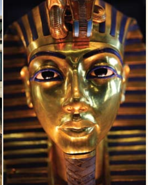
The Majestic Tutankhamun, Cairo