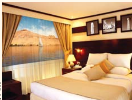
Emeco Dahabiya cabin

R eturn to the gracious era of turn of the century travel and cruise the Nile in style on board a traditional sailing ship called a dahabiya. These boutique sailing boats are fully air-conditioned and carry just 16 passengers. Travel from Luxor to Aswan or vice versa, visiting temples and rural villages on the riverbank, soaking up the spectacular scenery. Each cruise has an English speaking Egyptologist who accompanies on-shore excursions,