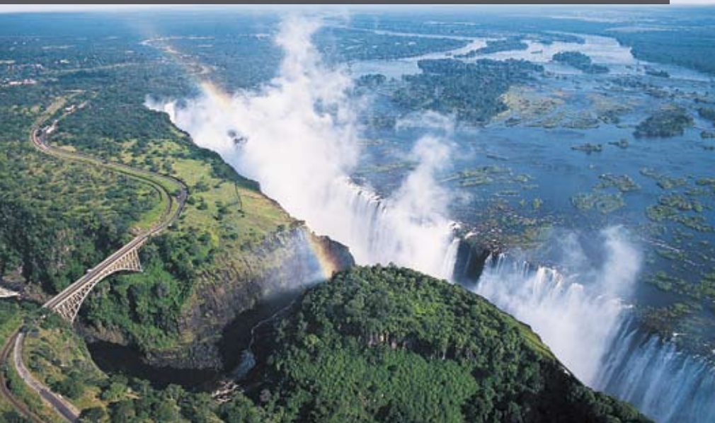
Victoria Falls