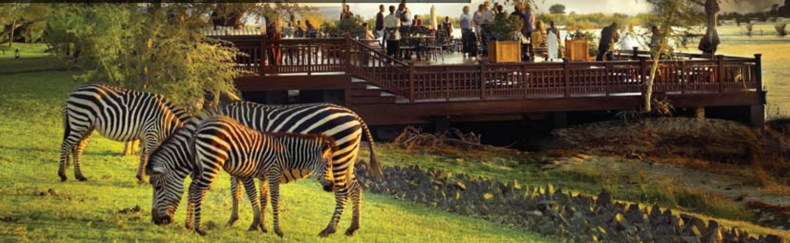
The Royal Livingstone