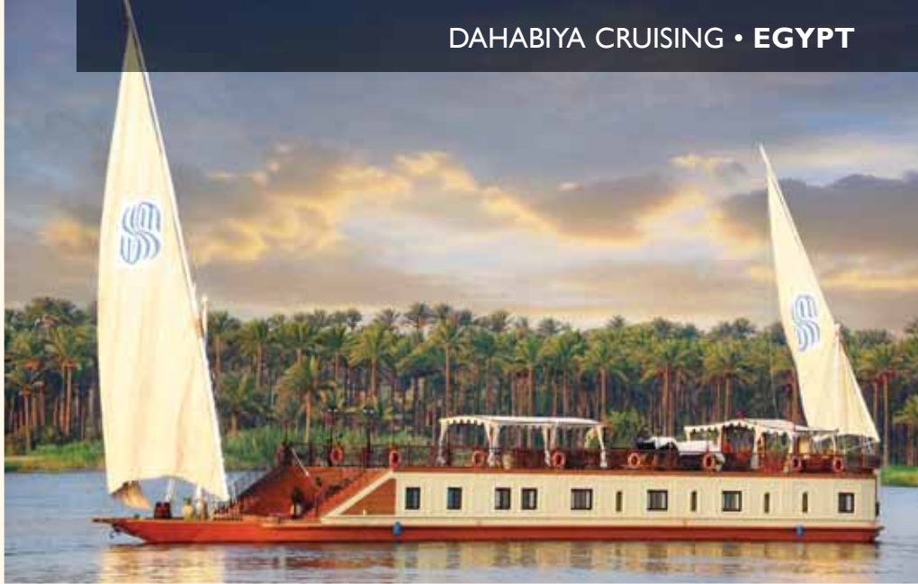
© Sonesta Cruise Collection Sonesta Dahabiya