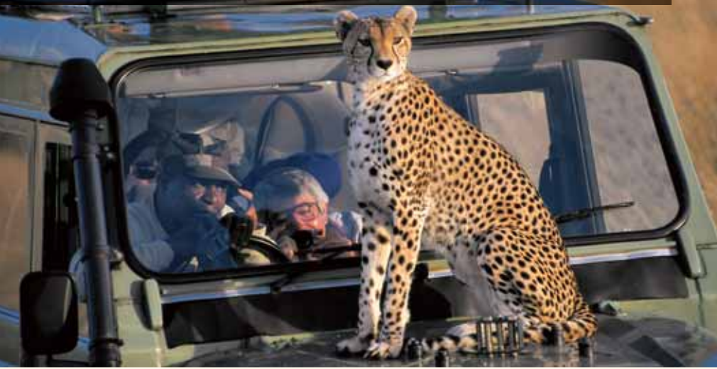
No camera can capture all the action!