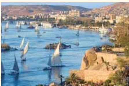
Feluccas on the Nile River, Aswan

To view our full range of Egypt tours, city stays and cruises, please call us for a copy of our 2009/10 Egypt brochure on (03) 9249 3777 or 1300 363 302.