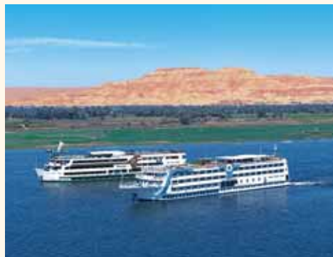
Sun Goddess & Nile Goddess