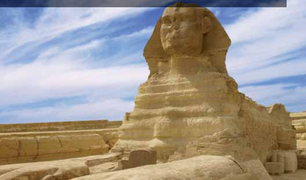
The Great Sphinx, Cairo © Emeco