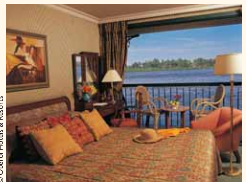
Oberoi Philae cabin