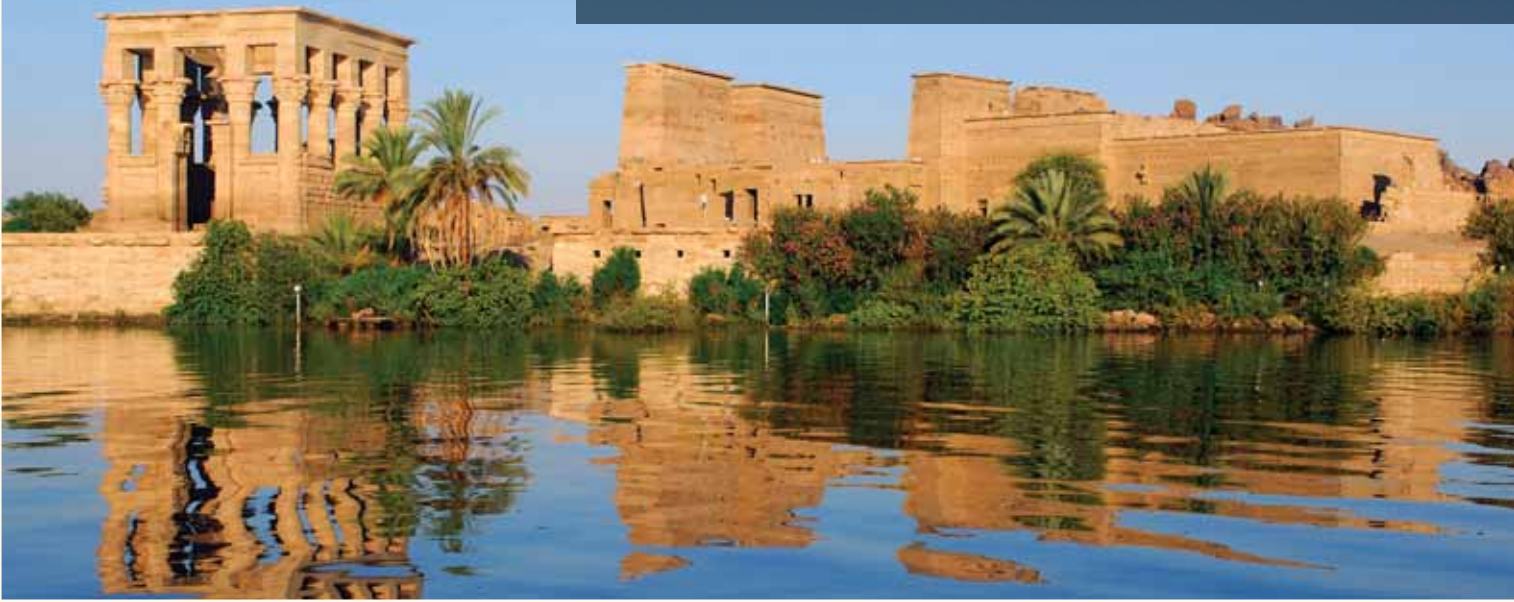
Philae Temple, Aswan