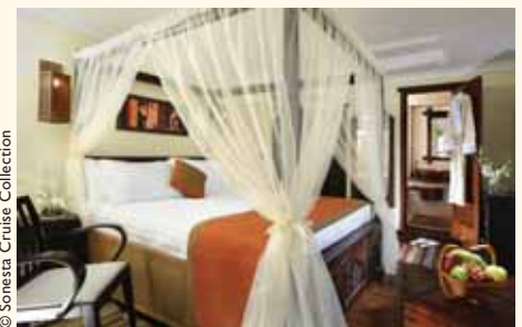
Sonesta Dahabiya bedroom