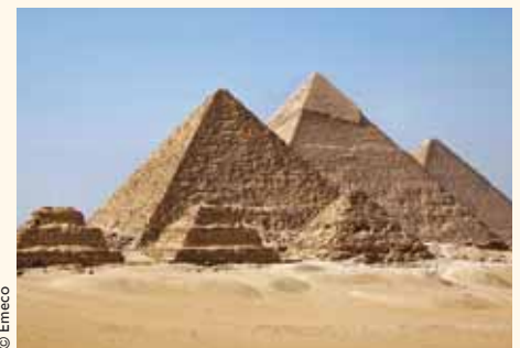
The famous Pyramids of Giza, Cairo

Travel upriver to Edfu to explore its impressive temple before cruising to Kom Ombo, an unusual double temple dedicated to the gods Sobek and Haroeris. BLD