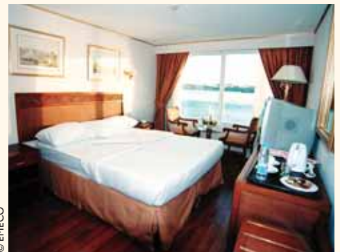
M/S TI-YI standard bedroom