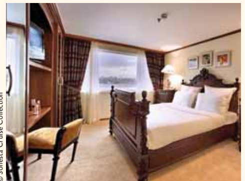
Star Goddess bedroom