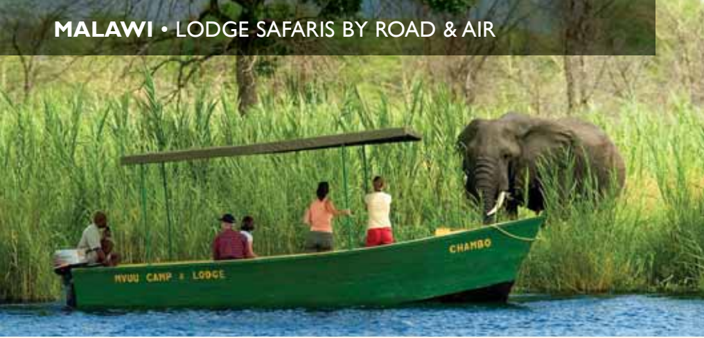
Malawian exploration