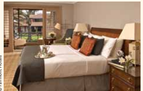
Fairmont The Norfolk Hotel

Hosting celebrities since 1902, this historic hotel is located in the heart of Nairobi. Its 217 comfortable rooms have private facilities, air-conditioning, mini-bar and room service while guest amenities include a pool, gym and the legendary Thorn Tree Café.