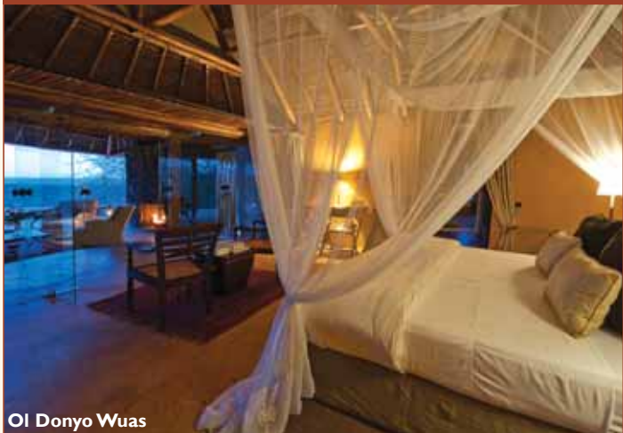
OI Donyo Wuas

Set in the beautiful Chyulu Hills with views of Mt Kilimanjaro, OI Donyo Wuas has 10 luxurious suites in 6 individual lodges, some with private pools. Activities include game drives, bush picnics, horseback safaris, day trips to Amboseli National Park, and Maasai village visits. Big game thrives here thanks to OI Donyo Wuas's involvement in community and wildlife projects. Children 6+ welcome.