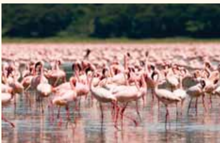
Colourful Lake Nakuru

After breakfast return to Nairobi. Tour ends.