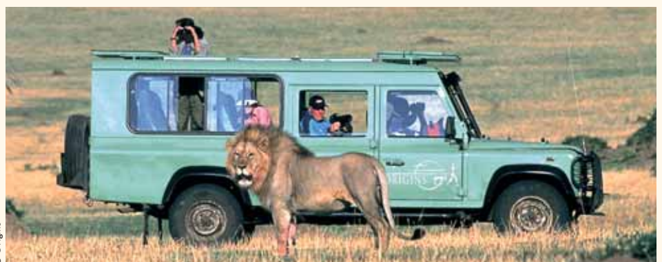
4WD gameviewing with Origins