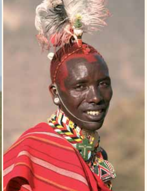
Samburu Warrior