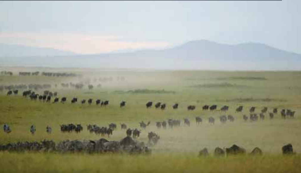
The great wildebeest migration