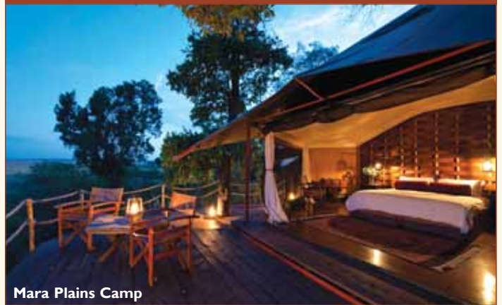
Mara Plains Camp

In the heart of big game country on the Ntiakatek River, picturesque Mara Plains Camp accommodates just 14 guests in 7 spacious and comfortable ensuite canvas rooms on raised decks. This eco-friendly camp also has a raised canvas dining room, cosy lounge and alfresco dining along the river. Game-viewing is by 4WD Land Cruisers with professional guides and only 4 or 5 guests per vehicle. Children 5+.