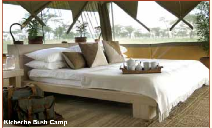
Kicheche Bush Camp

Set in the pristine Olare Orok Conservancy Area, Kicheche is a peaceful 6-tent unfenced camp where the game-viewing is incomparable. Intuitive safari guides and a flexible meal schedule allow for superb wildlife viewing opportunities and guests retire daily to comfortable insect-proof tents with quality beds and bush showers. Children welcome, however the camp is unfenced and there are wild animals around!