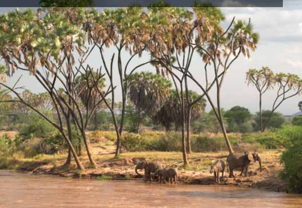
Stunning Samburu scenery