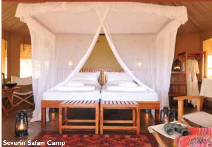
Severin Safari Camp

Close to famous Mzima Springs in Tsavo West National Park, Severin is well placed for excellent wildlife viewing. The camp has 21 large guest tents with ensuite bathroom and private terrace, as well as 6 suites. Relax in the open air bar, lounge and restaurant or by the pool and spa. Guided game drives and bush picnics are offered. Children welcome.