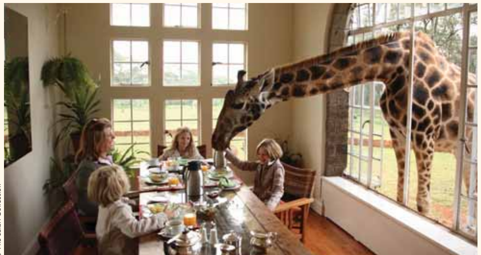
Meeting one of the locals at Giraffe Manor