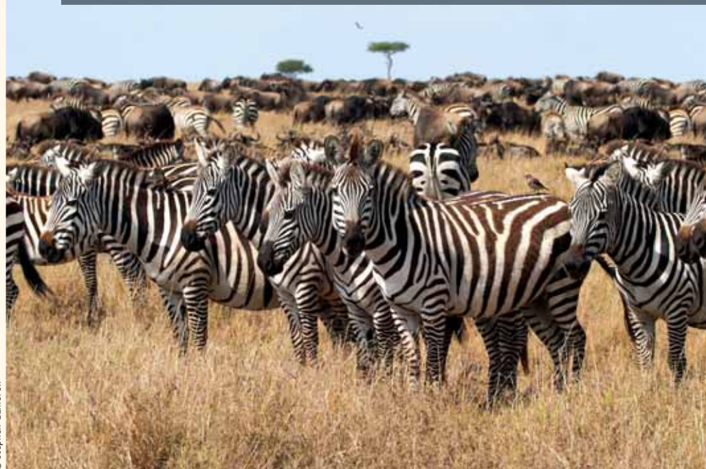
Zebra and wildebeest gathered on the Masai Mara plains