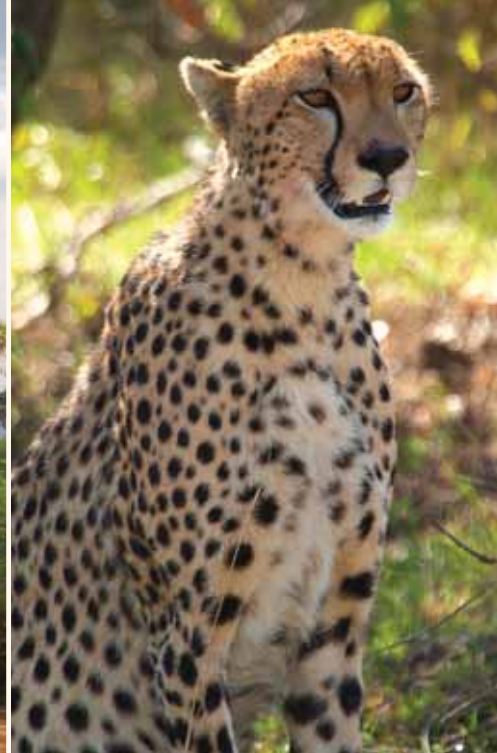
Cheetah on the lookout