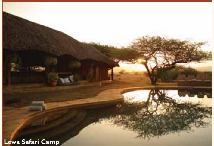
Lewa Safari Camp

This luxury camp spares no expense on comfort, and all its 12 tented rooms are equipped with running hot and cold water, flush toilets and access to a pool. Wildlife density is high thanks to the camp's conservation efforts, and guests can discover the concession's many species on game drives, horse and camel treks. Children welcome.