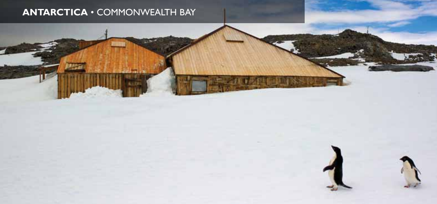
Sir Douglas Mawson's hut

COMMONWEALTH BAY, ROSS SEA & SUB-ANTARCTIC ISLANDS Crossing the Southern Ocean into deep Antarctica has challenged even the best sailors, but is well worth the adventure. The remote Ross Sea is the site of historic huts left by the polar explorers Scott and Shackleton as well as abundant wildlife, whilst the Commonwealth Bay region is an area rich in exploration history including Sir Douglas Mawson's hut, as well as breathtaking vistas of icebergs, penguins, diverse birdlife and seals. The Sub-Antarctic Islands include Snares, Auckland and Campbell Islands, plus the World Heritage site of Macquarie Island, home to 3 million Royal Penguins and hundreds of thousands of King Penguins.