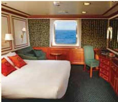
Junior Suite onboard the Orion

COMMONWEALTH BAY, ROSS SEA & SUB-ANTARCTIC ISLANDS Crossing the Southern Ocean into deep Antarctica has challenged even the best sailors, but is well worth the adventure. The remote Ross Sea is the site of historic huts left by the polar explorers Scott and Shackleton as well as abundant wildlife, whilst the Commonwealth Bay region is an area rich in exploration history including Sir Douglas Mawson's hut, as well as breathtaking vistas of icebergs, penguins, diverse birdlife and seals. The Sub-Antarctic Islands include Snares, Auckland and Campbell Islands, plus the World Heritage site of Macquarie Island, home to 3 million Royal Penguins and hundreds of thousands of King Penguins.