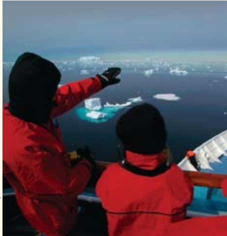
Beautiful Antarctic vista