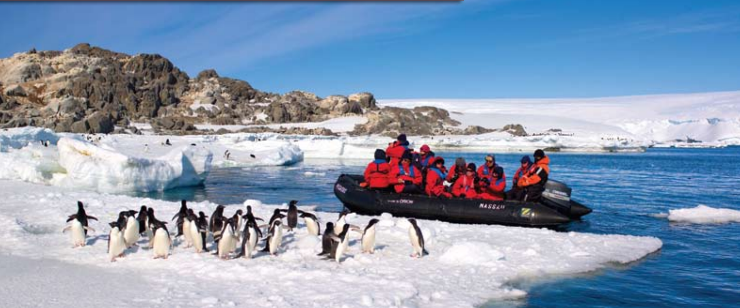
Zodiac excursion