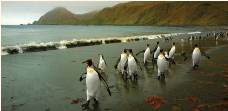
March of the Penguins, Macquarie Island