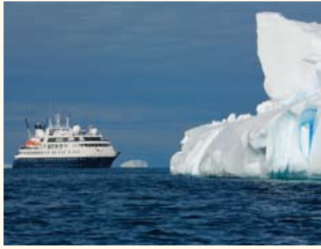
Orion cruising amongst magnificent icebergs

Price excludes: Items of a personal nature, including but not limited to: travel and medical insurance, laundry charges, shopping onboard, bar expenses, hair dressing and massage treatments, optional shore experiences, medical treatments, telephone and internet charges, gratuities (optional).