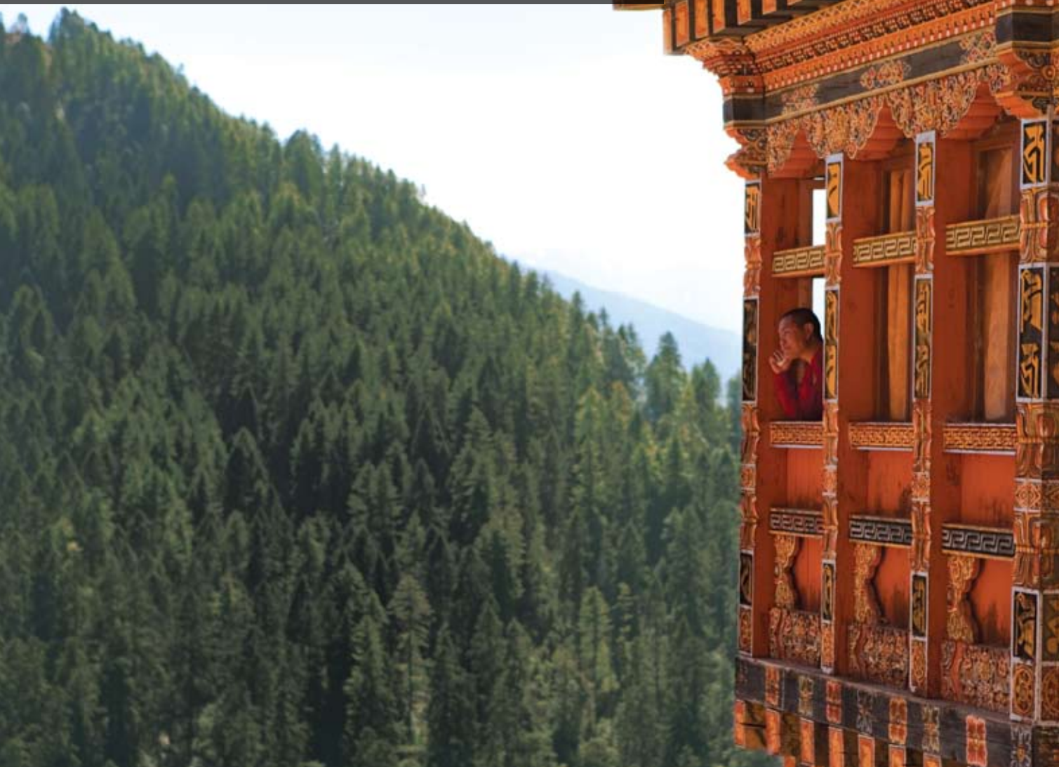
A monk contemplates the view from a remote mountain monastery