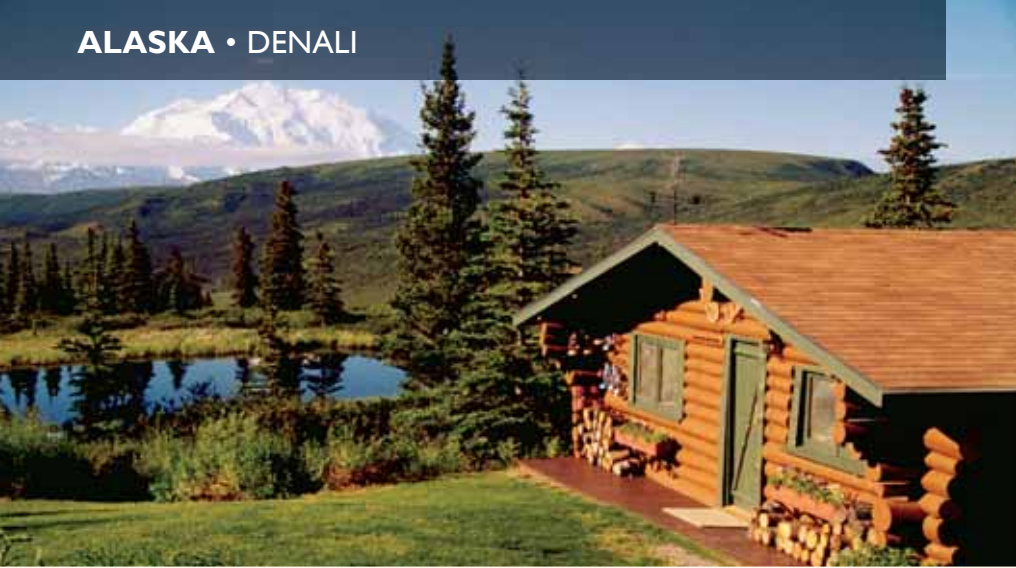
Mt McKinley from Camp Denali