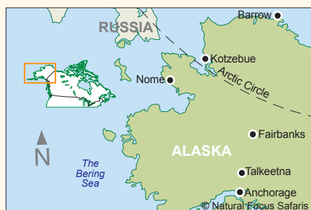
Optional Mt McKinley flightseeing