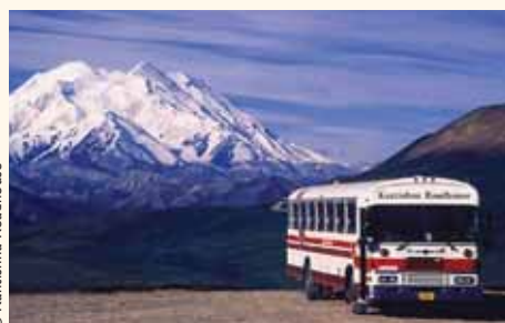
Mt McKinley, Alaska's highest mountain

Day 4 Tour ends Anchorage Courtesy shuttle to the railway station for the return journey to Anchorage aboard the Alaska Railroad (standard seating). Tour ends on arrival in Anchorage at 20.00.