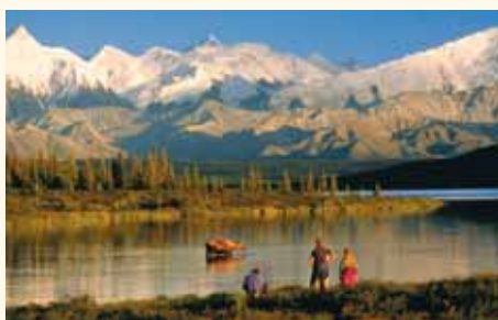
Scenic Denali National Park