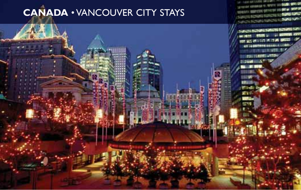
Vibrant Vancouver