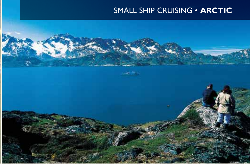
Beautiful Arctic Bay