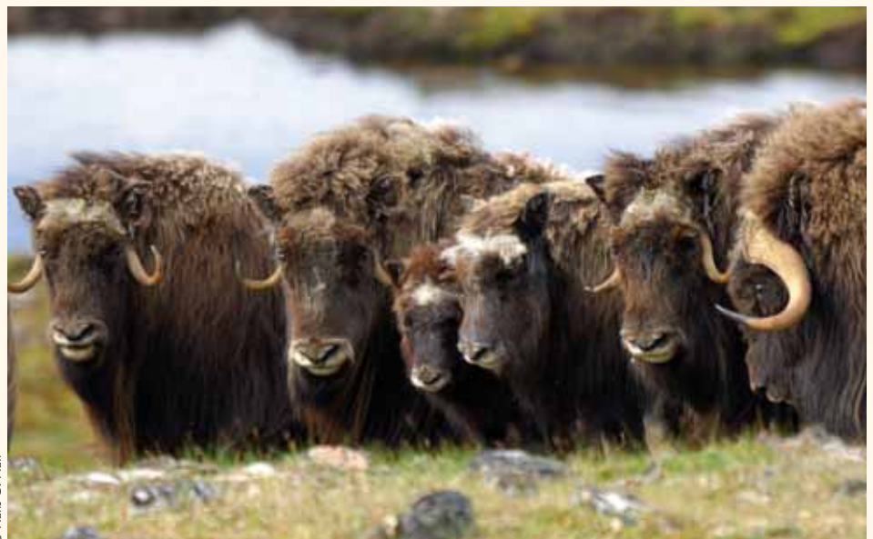
Muskox on Quaqtaq Island