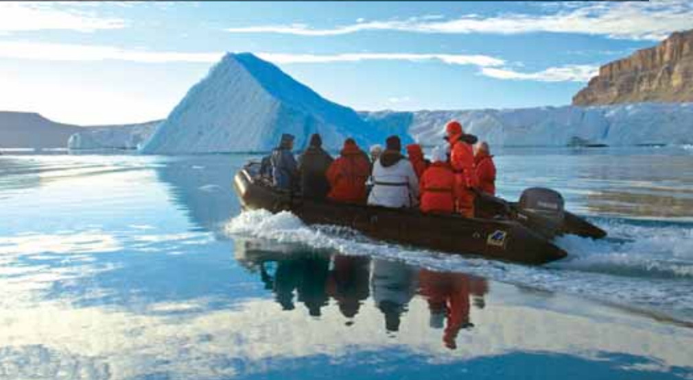
Exploring the picturesque Qikiqtarjuaq coast