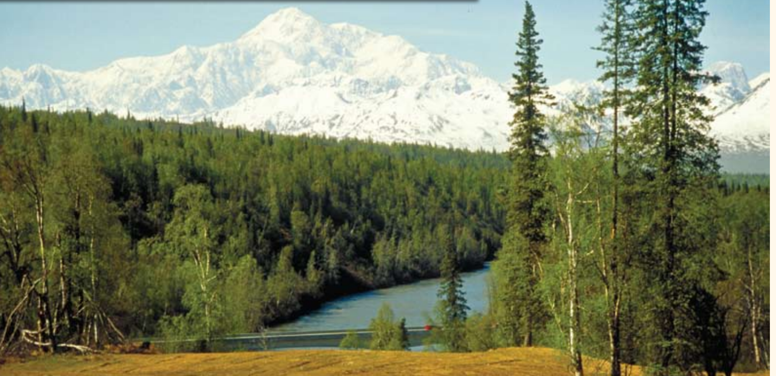
Mt McKinley from Denali National Park