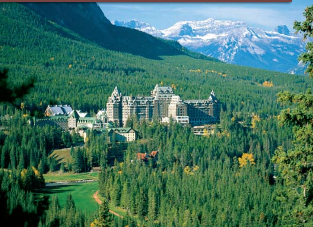
Stunning Banff Springs Hotel