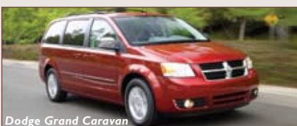
Dodge Grand Caravan