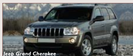
Jeep Grand Cherokee

Car type guide: Most Avis vehicles in Canada include air conditioning, power steering, power ABS brakes, Air bag(s), Tinted Glass, AM/FM stereo radio, Cassette/CD player.