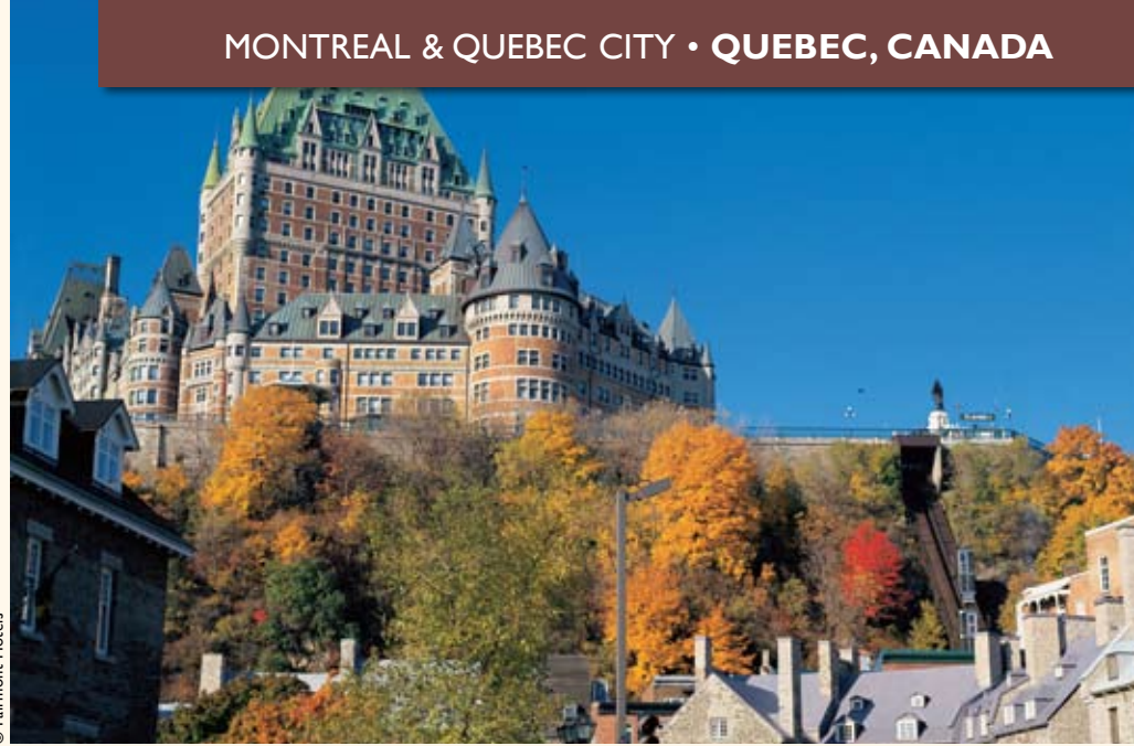
Fairmont Le Chateau Frontenac Old Quebec City