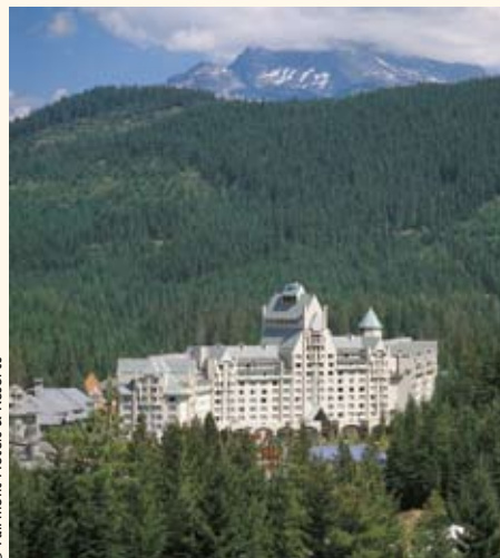
Stunning Fairmont Chateau Whistler

Departure transfer to downtown Vancouver.