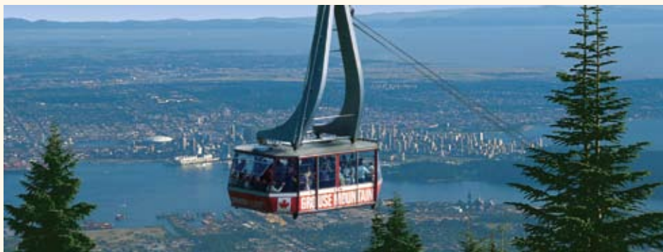
Grouse Mountain Gondola