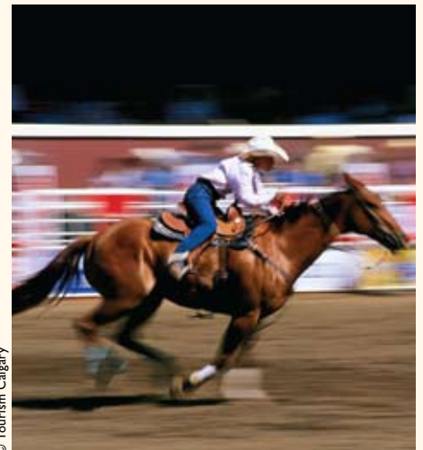
Action galore at the Calgary Stampede!