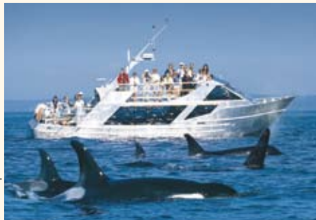
Whale watching aboard the Orca Spirit, Victoria

Further details for all tours on request.