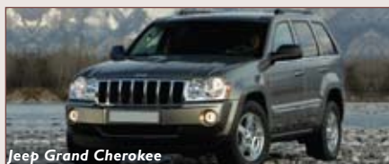
Jeep Grand Cherokee

Car type guide: Most Avis vehicles in Canada include air conditioning, power steering, power ABS brakes, Air bag(s), Tinted Glass, AM/FM stereo radio, Cassette/CD player.