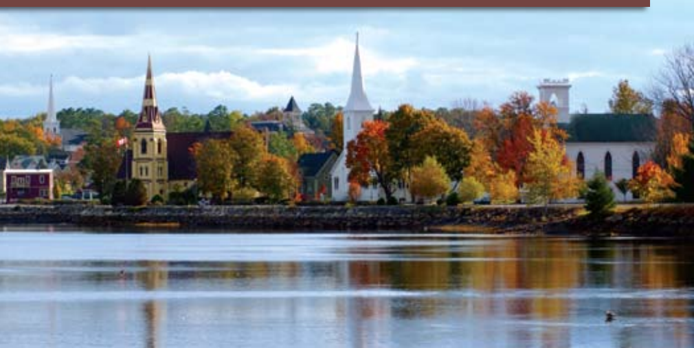
World Heritage Town of Lunenburg