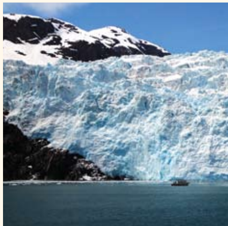
The awesome scale of Holgate Glacier

Overlooking Mt Susitna, this conveniently located downtown hotel has 90 rooms and 3 master suites all with kitchenettes. Facilities include a 24-hour gym, laundry and free wireless internet access. Guests receive complimentary breakfast.