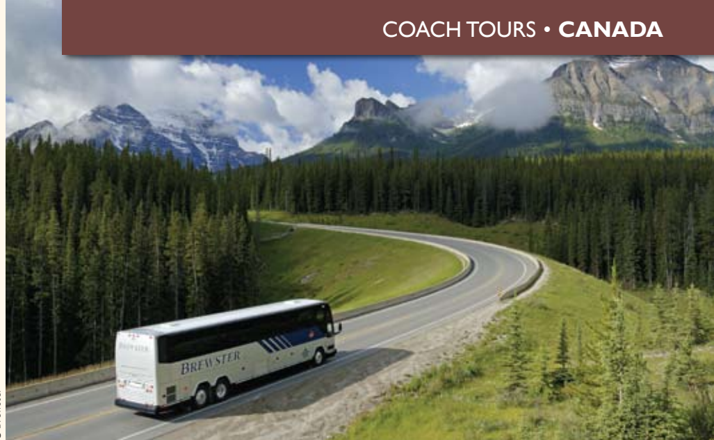
Spectacular scenery by luxury Brewster coach