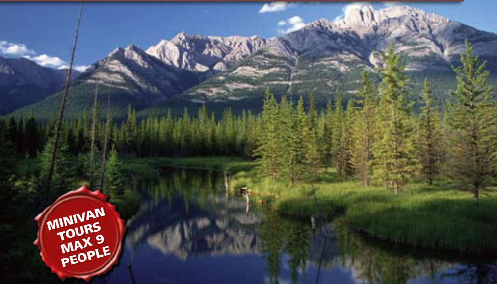
Bow Lakes, Banff

SMALL GROUP MINIVAN TOURS Explore the Rockies by air-conditioned minivan with a small group of travellers accompanied by a knowledgeable driver/guide. Daily itineraries are flexible and personalised, allowing for plenty of sightseeing and time for individual interests. Accommodation is in smaller, more intimate hotels and lodges.