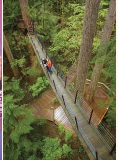
Capilano Suspension Bridge