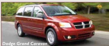
Dodge Grand Caravan