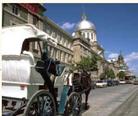
Horse & Buggy Ride, Montreal

Note: This tour can easily be extended or modified.