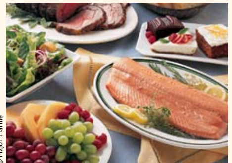
Salmon and prime rib lunch!

Board the Fairweather or similar at 12.30 for your cruise. Return to Whittier at 18.30.