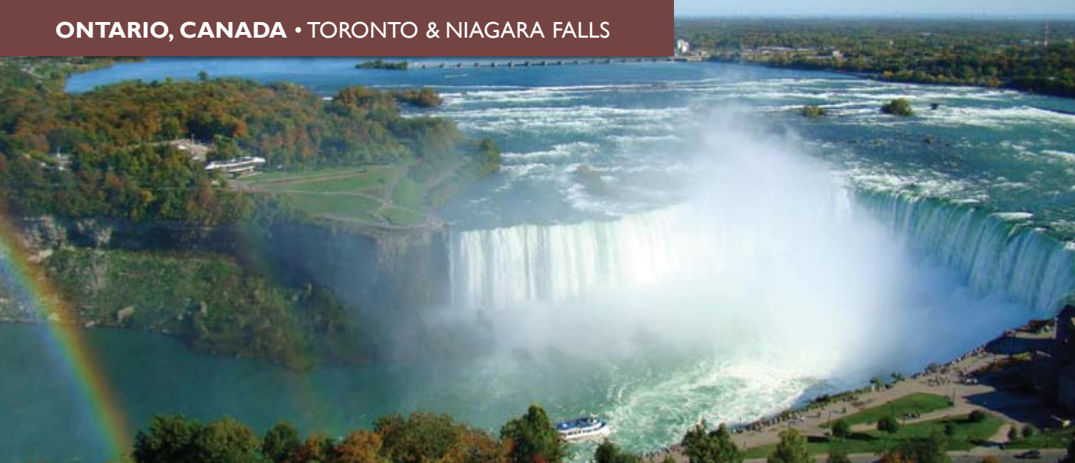
"Maid of the Mist" - Niagara Falls

ONTARIO From sensational scenery to great cities Ontario is the home of Canada's capital, Ottawa, its largest city, Toronto, and the famous Niagara Falls. In the south it borders the spectacular Great Lakes and in the north the arctic regions of Hudson Bay. Below is just a brief glimpse of the many tours we have available.