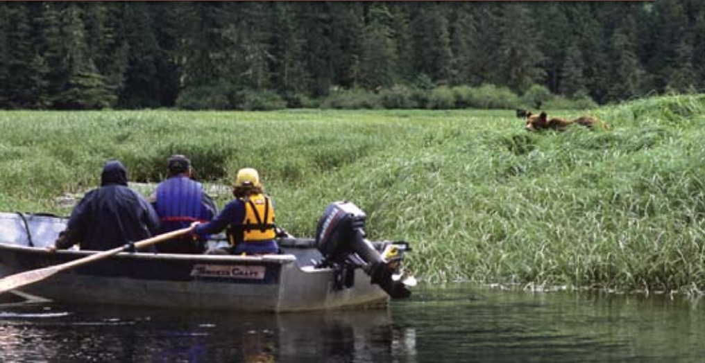
Bear viewing