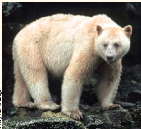
The rare Spirit (Kermode) Bear

Day 4 Tour ends Vancouver Fly back to Vancouver where your tour ends.