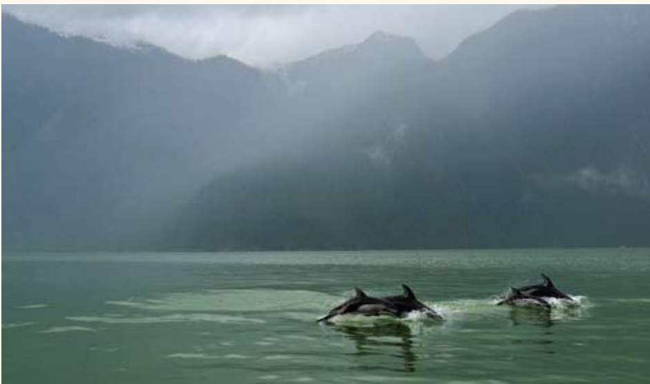
Magical Knight Inlet