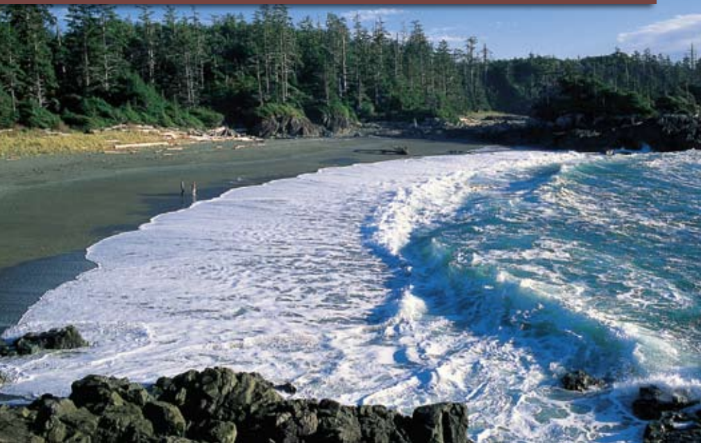
South Beach in the Pacific Rim National Park, Tofino