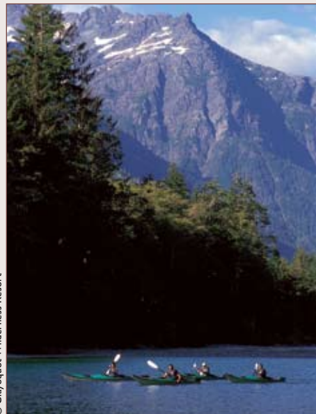
Kayaking through tranquil waterways

Day 4 Tour ends Vancouver After breakfast return to Vancouver. Tour ends.