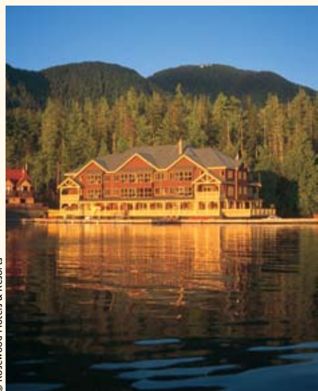
Sunset at King Pacific Lodge