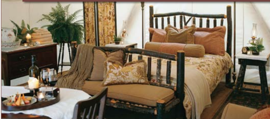
Deluxe Outpost Tent

A ccessible only by boat or floatplane, E co-conscious Clayoquot Wilderness Outpost is a secluded enclave with 12 luxury ensuite tents and 8 safari-style tents with private showers and composting toilets. There is also a ranch-style cookhouse providing world class cuisine, lounge, spa, wood fired hot tubs and woodstoves. While at Clayoquot enjoy both guided and unguided activities including paddling, biking and hiking. This region is home to prolific wildlife including bears, puffins and porpoises. You are also invited to take part in environmental programs funded by the resort.