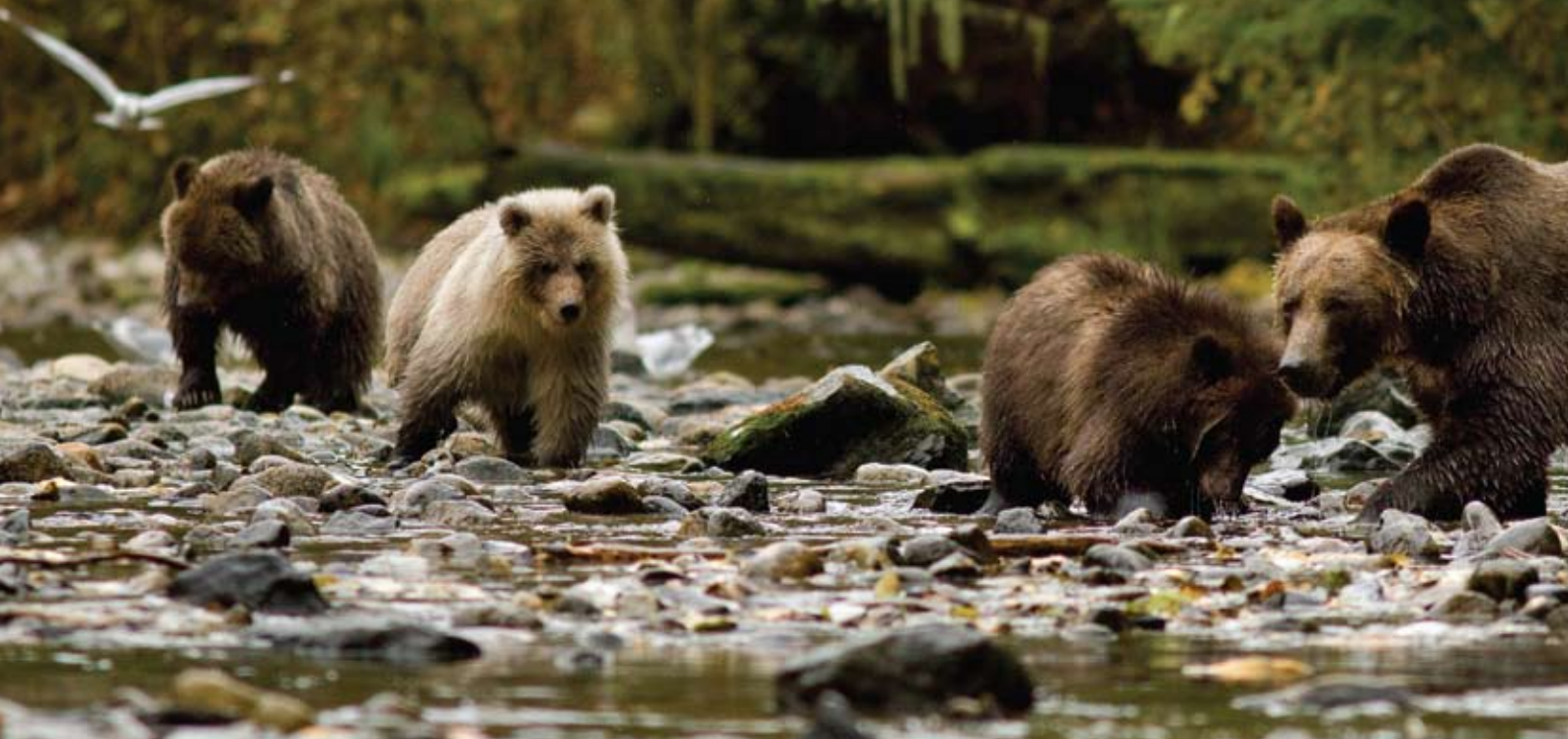
Knight Inlet Lodge - Premier Grizzly Bear viewing

“Thirty-five bear sightings in 5 days, seals and otters outside our room and Orca Whales just minutes from the lodge - I didn’t want to leave!” Sara Cameron.