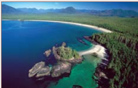
Beautiful Clayoquot Sound

Day 1 Wilderness Outpost Enjoy a floatplane flight (approx. 1 hr) enroute to the resort. Spend the afternoon fishing or trekking before savouring dinner in the charming cookhouse.