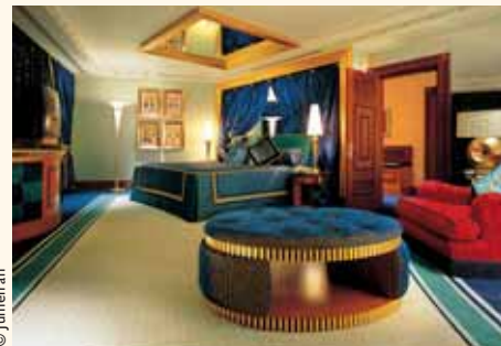
Burj Al Arab one bedroom deluxe suite

The luxurious Burj Al Arab dominates the Dubai coastline and has 202 beautifully decorated air-conditioned suites with exquisite living and dining areas. Hotel facilities include 8 restaurants, shopping, access to Wild Wadi Water Park, The Assawan Spa & Health Club, swimming pools, squash court and fitness studios.