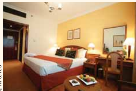
Marco Polo Hotel

Located in Dubai's oldest district - Deira, the Marco Polo Hotel is 15 minutes from Dubai Airport and 10 minutes from the city centre. Features include 128 well appointed rooms, an array of speciality restaurants, 24 hr coffee shop and outdoor swimming pool.