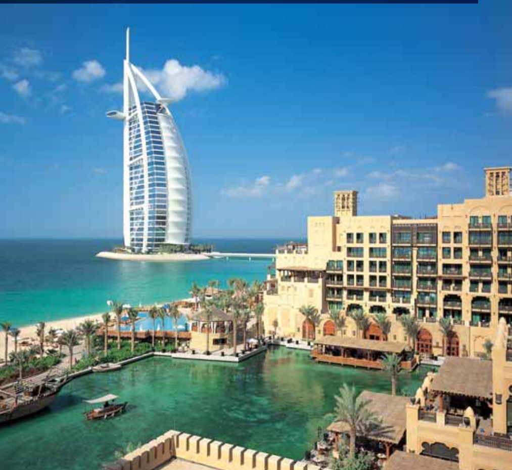
The magnificent Burj Al Arab with Madinat Jumeirah Resort in the foreground