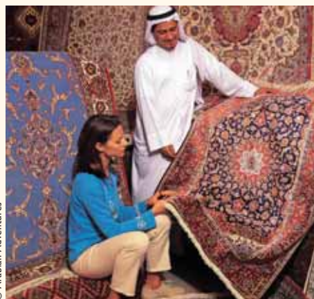
Shopping in Dubai

A glistening, modern city in the romantic deserts of Arabia, Dubai has so much to offer that it is perfect both for a stopover or holiday. The city is a mix of old and new, with traditional buildings along the Dubai Creek side by side with soaring skyscrapers. Visit the magnificent Jumeirah Mosque and picturesque Bastakiya, with its historical wind-towered merchant houses. Cruise aboard a traditional dhow or travel out to the desert for dinner in the dunes. If you love shopping Dubai is a shopper's heaven, from the winding alleyways of the exotic spice souk, the rug traders or the dazzling gold souk, to the modern shopping malls and exclusive boutiques selling designer fashions and electronics. Dubai is also known for its fine dining restaurants and great beaches.