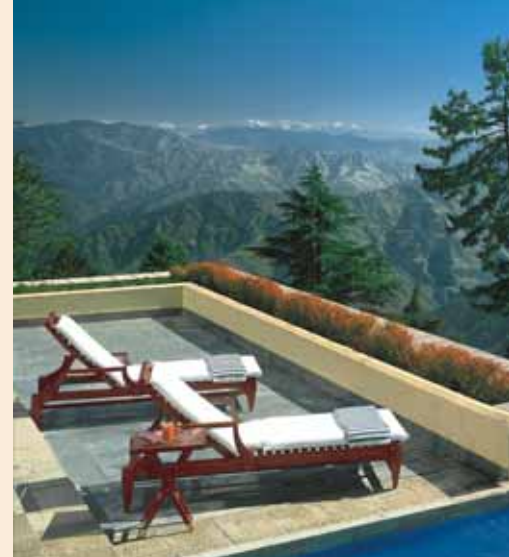
Outdoor deck & jacuzzi