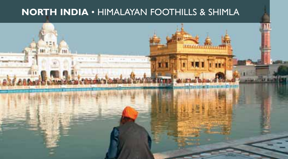
The Golden Temple