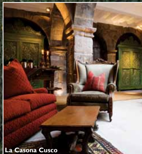
La Casona Cusco