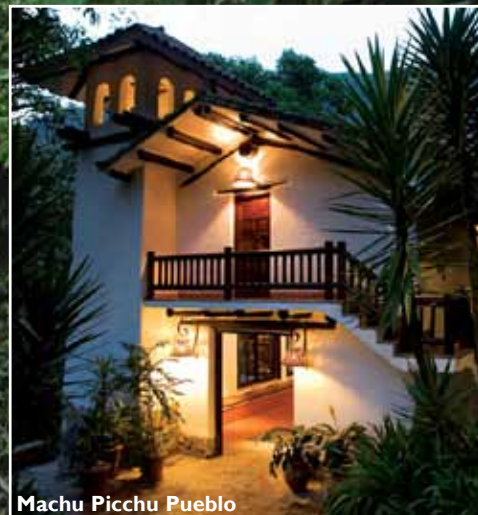
Machu Picchu Pueblo