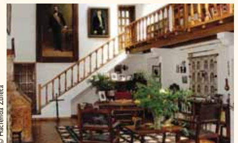
Hacienda Zuleta library