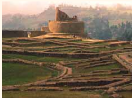
Stunning ruins of Ingapirca