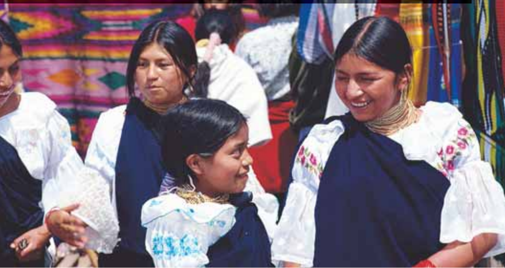
Indigenous market in Otavalo