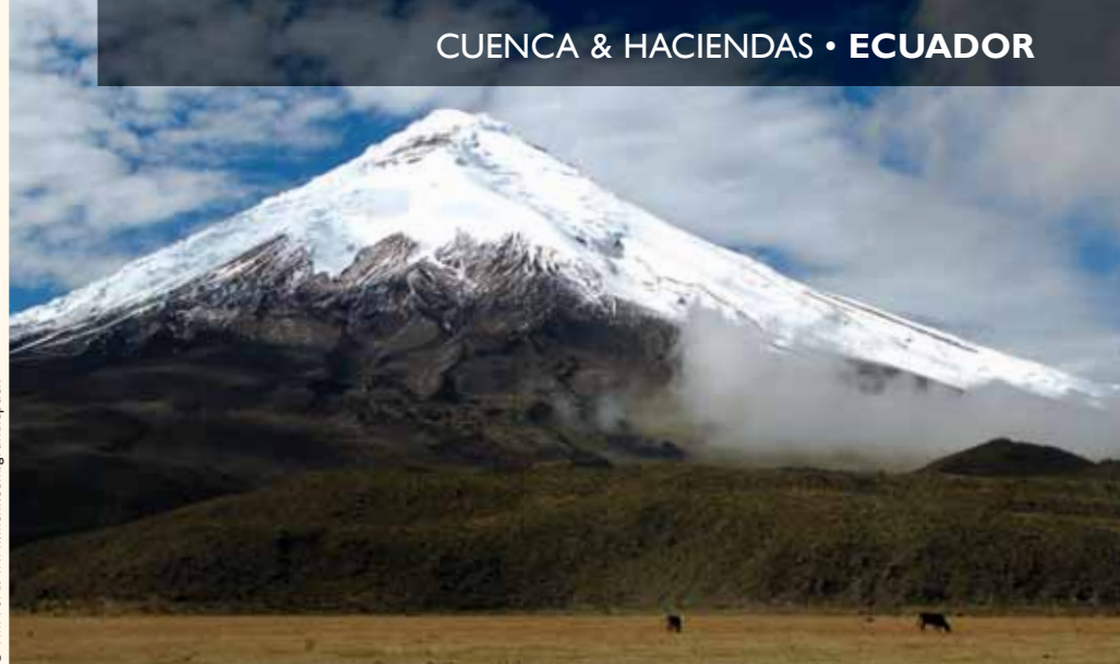
Cotopaxi Volcano, the highest active volcano in the world

Note: This tour also operates in reverse departing on Tue, Thu & Sat.