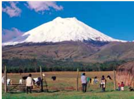
Living at the foot of Cotopaxi

Drive through some of the most picturesque indigenous areas of the country before reaching the Alausi train station. Board a local train for a unique journey down the Devil's Nose – a steep section of track which descends over 1000m via a series of switchbacks. Continue via the Ingapirca ruins before arriving in Cuenca for overnight. B