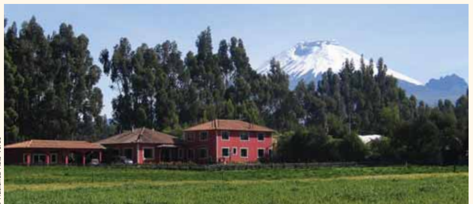
Picturesque Hacienda Hato Verde