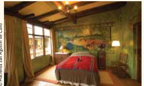
Hacienda San Agustin de Callo

Close to the entrance of Cotopaxi National Park, Hato Verde is part of the rich tradition of grand estates. The house offers 9 luxurious rooms with private bathrooms and fireplaces, and an exquisite dining experience. Activities offered (at additional cost) include horse riding, and trekking. B