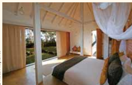
Altiplánico Rapa Nui

A small, charming hotel in the heart of Hanga Roa, surrounded by beautiful gardens. The hotel offers 40 ensuite rooms, family friendly service, restaurant, lounge and swimming pool.